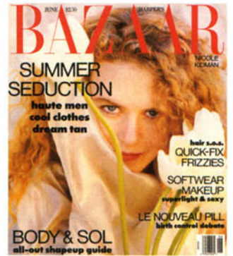
1991 Nicole Kidman