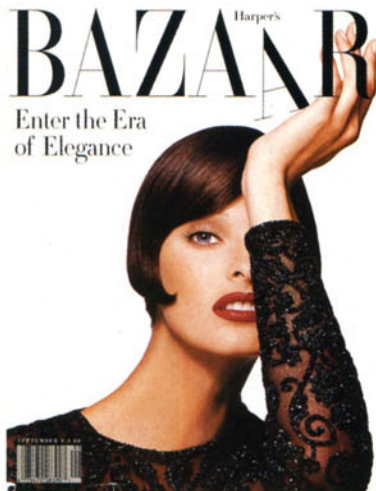
1992 Tilberis's first cover