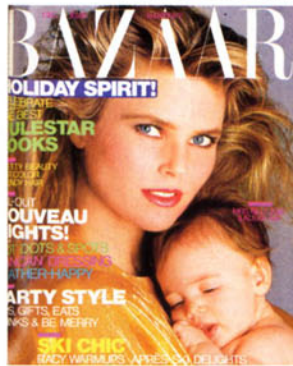
1986 Christie Brinkley and Alexa Ray Joel, by Francesco Scavullo