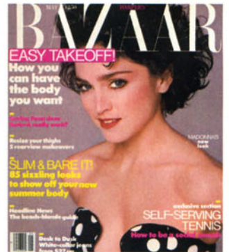
1988 Madonna vamps for Scavullo