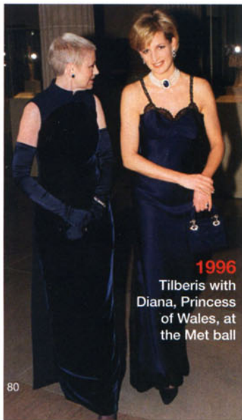
1996 Tilberis with Diana, Princess of Wales, at the Met ball